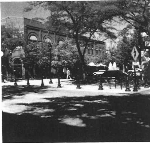
Downtown Moscow, Idaho